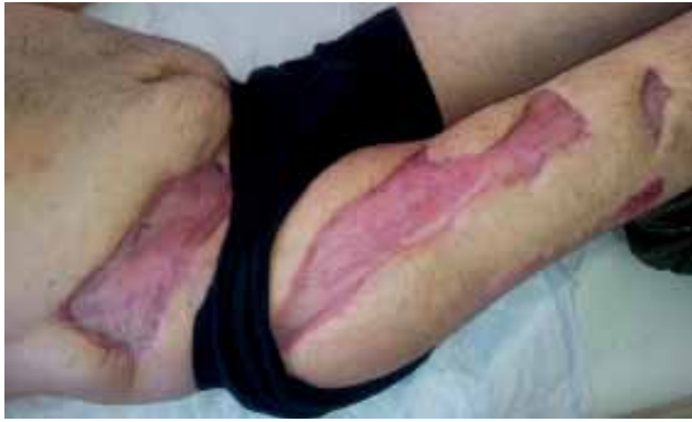
Figure 4. Three months after surgery, showing wound healing.

dosages of drugs. Ventilatory support was discontinued 25 days after the trauma. Three days later, oral intake was initiated and well-tolerated. On the 52nd day, the patient was discharged and remitted to the plastic surgery unit, where his wound continues to be treated to date (Fig. 4).