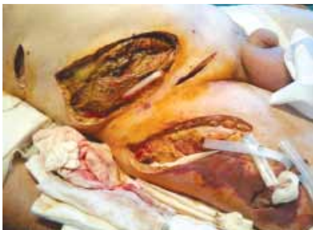
Figure 2. Day 5: Necrotizing fasciitis affecting the lower anterior abdominal wall and right thigh after wide surgical debridement. Penrose drainages were placed in order to prevent retention of secretions and facilitate subsequent washing.

The patient was re-admitted in the ICU, where his critical management continued with wide-spectrum antibiotics (meropenem, linezolid and fluconazole). A microbiological test of wound liquid indicated growth of E. coli , Enterococcus faecalis , and Streptococcus mitis (Fig. 3). He had a slow recovery consisting continued washing of the wound and decreased