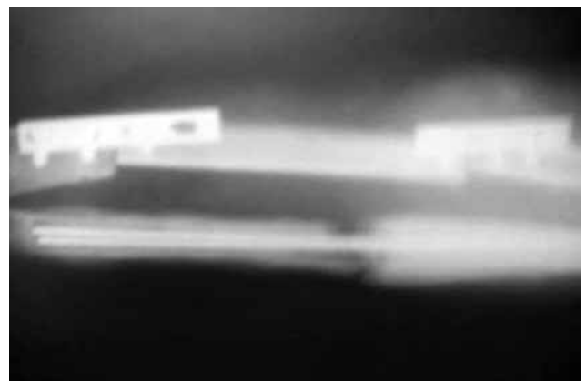
Fig. 5. Free fibula transfer for radius reconstruction; the fibula was fixed by two plates.

Using end-to-side arterial anastomosis in extremity reconstruction was first described and popularized by Godina in 1970. [12] The advantages of this technique include: decreased vessel spasm, elimination of vessel mismatch and preservation of the distal run-off. [2,4,6,12,13] Adams et al. [2] showed that the hole technique is better for large artery (>1.5 mm) and slit technique for small artery (<1.5 mm). This avoids potentially irreversible damage in the recipient vessel. The final result also depends on the surgical expertise. Zhang et al. [4] examined the incident angle in carotid to carotid end-to-side anastomosis in rats. They performed anastomoses with angles of 45°, 90°, and 135°, with an elliptical arteriotomy. They concluded no statistically significant flow difference between 45° and 90° anastomoses. Some of the studies recommended that different lengths of slit arteriotomy should be adjusted with the diameter of the donor vessel. [2] The length of slit arteriotomy is at least twice the diameter of the donor vessel. [14] If the length of the slit arteriotomy is more than twice the diameter of the donor vessel, it leads to the stretching of the donor vessel and caliber narrowing.