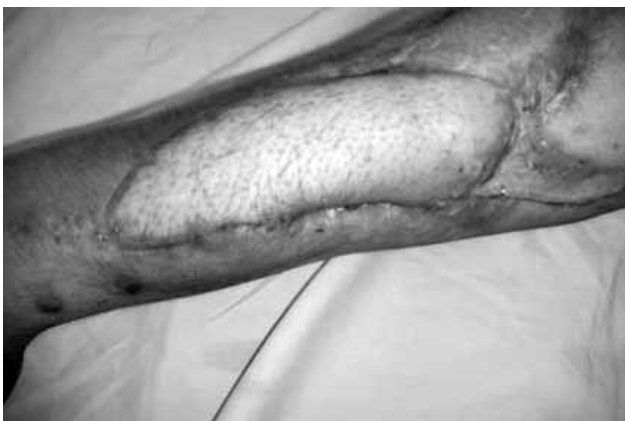
Fig. 3. Free fibula transfer with skin paddle forearm reconstruction (after 6 weeks).

A total of 32 patients were included in the study. Eleven patients (12 to 43 years old) with single artery were confirmed by angiography. Free flaps were performed by end-to-side anastomosis in these patients who had a single artery remaining in their extremities after major trauma (Gustilo IIIC). End-to-end anastomosis was performed on the other patients (n=21). End-to-side anastomosis was applied for limb salvage in extremity reconstruction with a single artery, preserving recipient's flow and preserving donor's flow in all patients (Figs. 3-5). It should be mentioned that seven of the patients had been transferred to us from other provinces. The mean time from the injury to the flap reconstruction was 34 days. All patients had severe fracture or bone deficit plus soft tissue defect. The mechanism of injury, defect location, type of flap, recipient's artery, and others data are included in Table 1. Post-