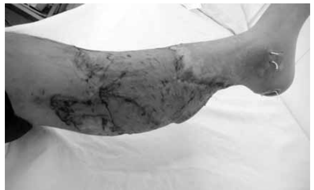
Fig. 4. Latissimus dorsi musculocutaneous flap transfer after 3 weeks; end-to-side anastomosis was performed in posterior tibialis artery.