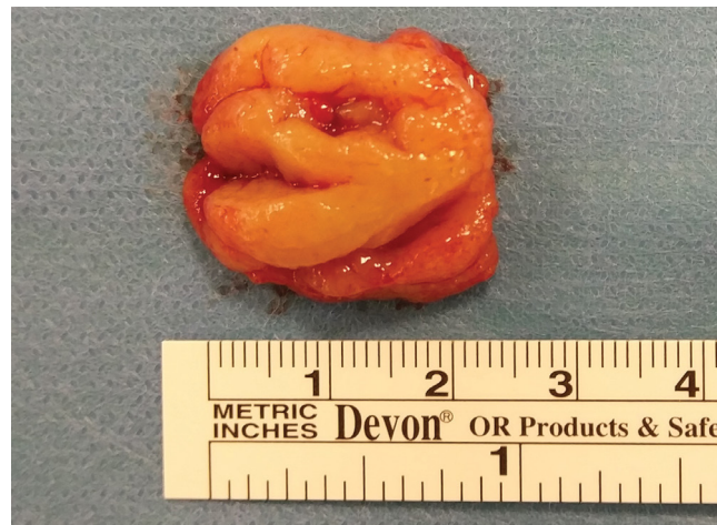
Figure 2. The image shows the surgical specimen of adenoid tissue approximately 2.5 cm in size

as foreign body, subglottic cyst, web or stenosis that could have led to airway obstruction. Adenoidectomy was performed and the patient was transferred to the PICU (Fig. 2). A dramatic improvement was observed, and the patient was extubated one day after the surgery. After observation for three days in the otorhinolaryngology department, the patient was discharged in a stable condition.