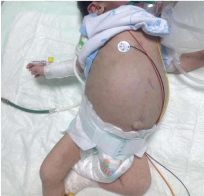
Figure 1. Two-month-old female patient with Wolman disease, showing abdominal distension.

5 Şevket Yılmaz Training and Research Hospital, Clinic of Pediatric Neurology, Bursa, Turkey