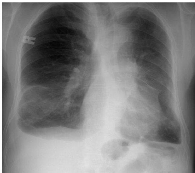
Figure 3: The x-ray showing regressed right-sided pleural effusion.