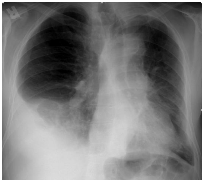
Figure 2 The x-ray showing a right-sided pleural effusion.