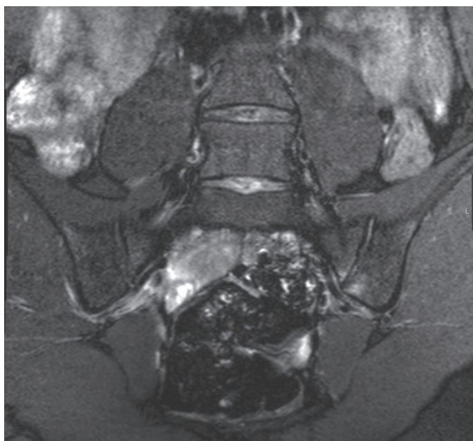
FIGURE 1. The MRI shows bone marrow edema in the sacral and iliac wings of both the right and left sacroiliac joints.

attended our outpatient clinic with the same complaints. On physical examination, lumbar flexion was restricted and painful with the sacroiliac stress test positive on the left side. The erythrocyte sedimentation rate (ESR) and C reactive protein (CRP) were measured in the normal range, and the patient was HLA B27-positive. MRI of the sacroiliac joint revealed that bone marrow edema was detected in the sacral and iliac wings of both the right and left sacroiliac joints, consistent with active sacroiliitis (Figure 1). A dermatology consultation was requested and isotretinoin treatment was ended after the fourth month. Her complaints alleviated with NSAID therapy after 2 weeks and her complaints resolved after 2 months.