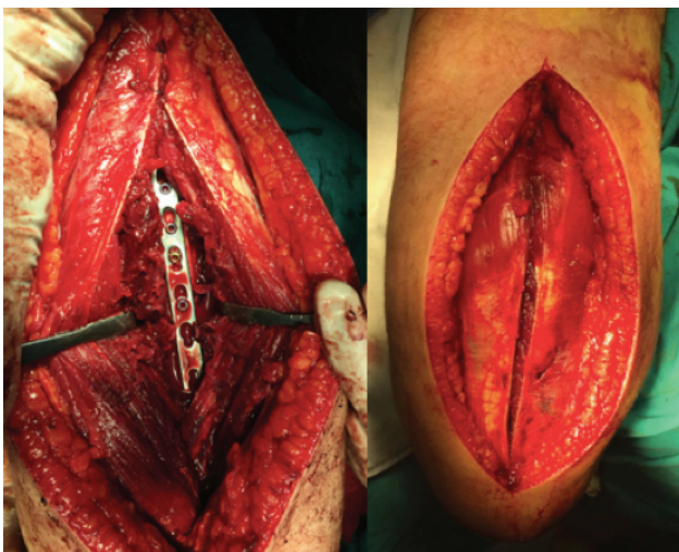
Figure 1. Triceps-splitting approach to humerus shaft with single plating. (A) During the plate application and (B) at the end of the operation.

The triceps-sparing approach was applied as described by Gerwin et al. 12 . After passing through the skin and deep fascia in the same way as in the split approach, and by retracting the triceps muscle medially, the lateral brachial cutaneous nerve was identified as the branch of the radial nerve over the posterior lateral intermuscular septum. Following the course of the nerve proximally, the location was found where the radial nerve penetrated the intermuscular septum. By opening the intermuscular septum approximately three cm above the radial nerve, easier mobilization of the radial nerve was provided. The nerve was suspended and thereby protected throughout the operation. The medial and lateral heads of the triceps were raised from the intermuscular septum laterally and subperiosteally from the posterior edge of humerus towards the ulnar side. Gauze was placed between the posterior aspect of the humerus and the triceps, then the triceps and the radial nerve were retracted medially. When a more proximal view was required, this exposure was extended as far as the axillary nerve (Figure 2).