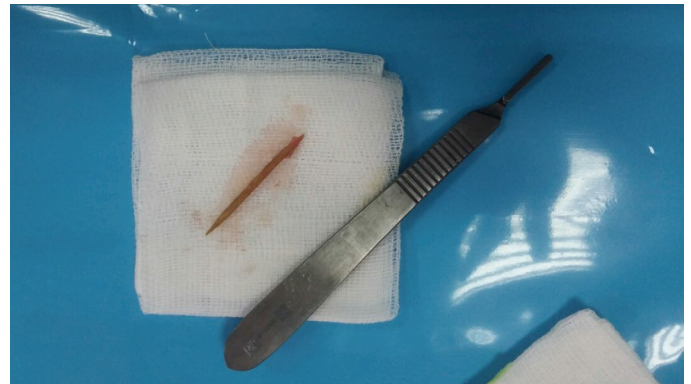
Figure 2. The toothpick removed from the abscess

Written informed consent was obtained from patient in this case.