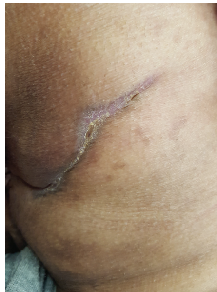
Figure 4. The patient's healing observed 6 weeks after the procedure