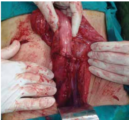
Figure 3. Postoperative appearance

defecation. The puborectal and external sphincter muscles also relax, allowing the pelvic floor to descend and the anorectal angle to straighten. A problem with one or more of these structures causes incontinence and prolapse. 2 The condition was first described on papyrus approximately 3500 years ago, but its etiology is still debated today. Despite the many identified etiological risk factors, there are different theories regarding its etiology. Some authors have claimed that anatomic factors and intussusception lead to the condition, while another proposed that prolapse is a sliding type of hernia. 2,3 However, the most widely accepted theory is that rectal prolapse is caused by an anatomic defect resulting from various precipitating factors. 4