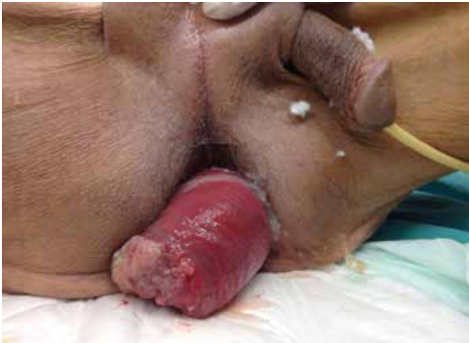
Figure 1. Preoperative appearance of the prolapsed portion of the bowel