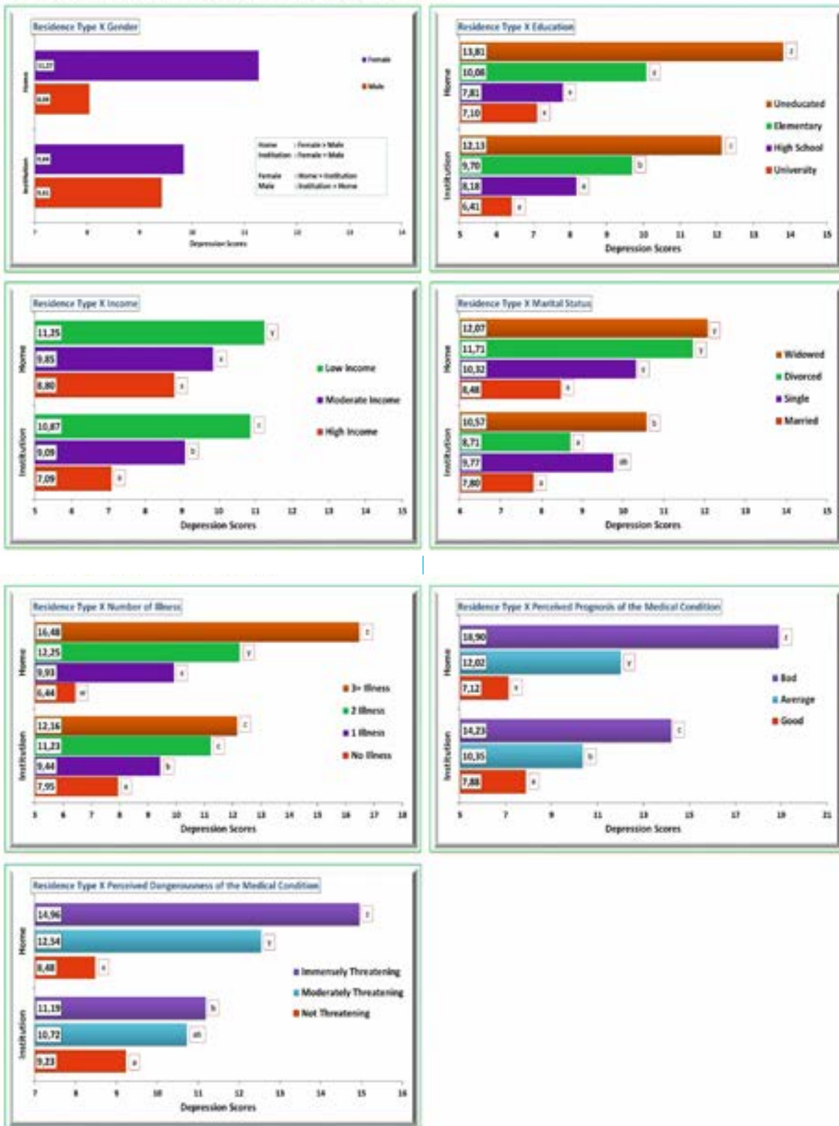
Figure 2: Group differences in depression scores