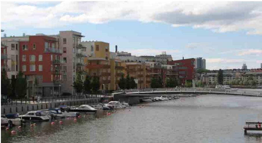
Figure 13. Hammarby Sjöstad, Stockholm

All buildings were designed by local architects who won architectural prizes about this area (Figure 13). Only sustainable, tried and tested, eco-friendly construction materials applied in the buildings. Local vegetation, oak forest and green surfaces on the main footpath help to collect rain water locally and ensure cleaner air in the dense urban landscape (Hammarby Sjöstad Report).