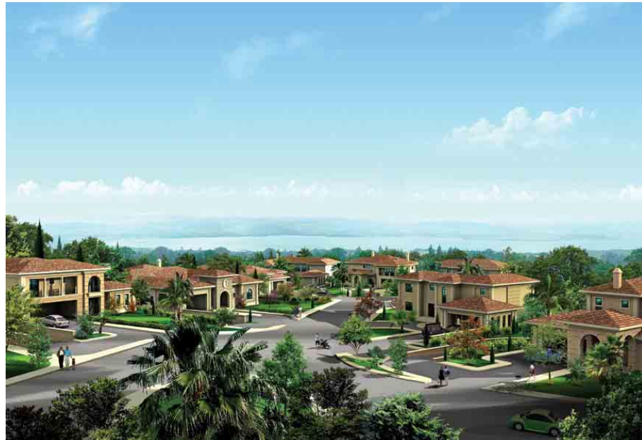
Figure 4. A perspective from Pelican Hill living environment

connect the blocks from two sides of valley which can destroy the valley with CO 2 emissions (Figure 6). Large water canal inside the valley are designed for recreational needs for the residents.