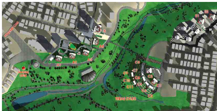
Figure 5. ParkVadi project in Dikmen-Çankaya, Ankara (ParkVadi catalogue)

‘BeysuPark’ is an urban project with a “new life” slogan where located on Beysukent on the southwest of Ankara. It covers 23.5 ha having 560 residences with blocks with 16 storeys, villas and terrace houses (Figure 7). High-rise blocks have duplex flats and 4 room flats. Villas have 2 types and terrace houses are kinds of duplex and triplex. All types are under 200 square meters having large building footprint. A shopping centre is designed for the daily needs of the residents. Cafes, shops and restaurants are situated there in an area about 2 ha. A swimming pool, basketball grounds exist as the sport facilities in the project. All area is covered with roads for the vehicles, power lines pass through the project area. Orientation of some