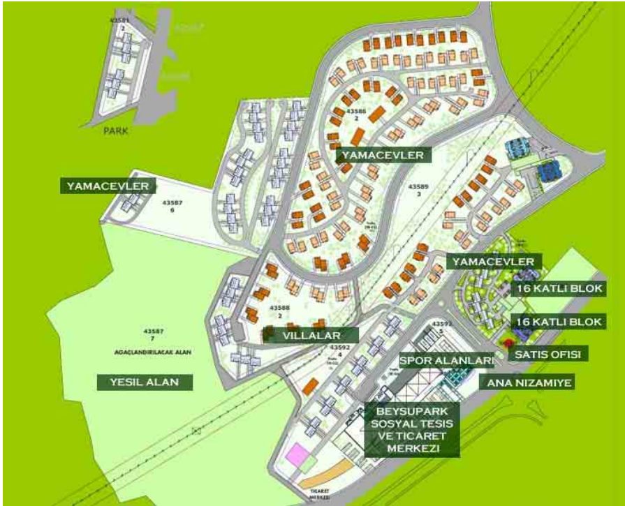
Figure 7. BeysuPark Project in Beysukent, Ankara (BeysuPark web site)