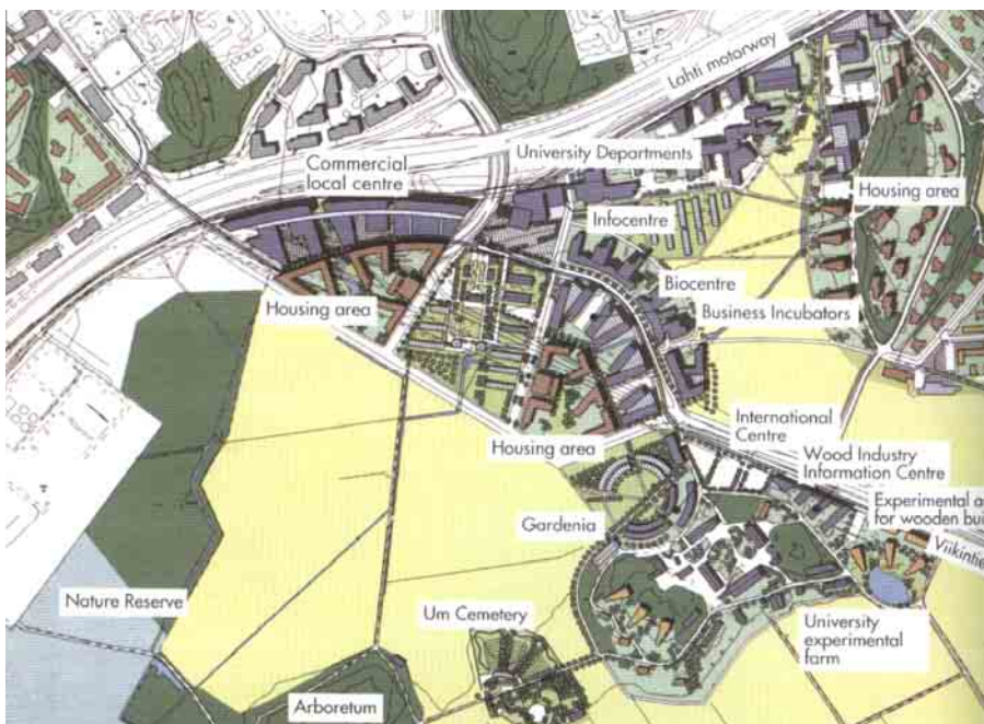
Figure 10. Eco-Viikki master plan (Viikki, 1995)

A region named 'Green Fingers' includes small hobby gardens and fields for the residents to produce organic food. Rain water collection ponds and composting facilities exist in this area.