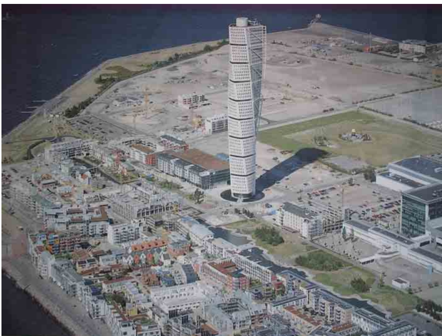
Figure 14. Bo01 Aerial view on Malmö

The last project is 'Bo01' from Malmö which covers an area about 25 ha (City of Malmö Ekostaden web site). The population is about 10000 inhabitants. It is a transformation project of old harbourfront brownfield to eco-tech settlement presented in Housing Expo '01. 60 different housing styles were tried in residential areas by architectural competitions. Offices, university, shops, marina, squares share 53% of the built environment (Figure 14). Open and green areas are supported with bike, and pedestrian