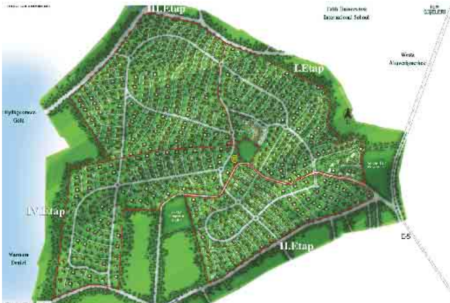
Figure 3. Pelican Hill project in Büyükçekmece, Istanbul (Pelican Hill web site)

building areas vary from 500 to 1100 squaremetres on plots about 930 to 1850 squaremetres (Ekonomik Yöntem, 2007) which have large building footprint. 8 different architectural styles are tried by American designers and the interior designs of them are made by famous Turkish designers (Arna, 2006). 'Large Californian style villas with Mediterranean atmosphere and mixed with Anatolian architecture' (Pelican Hill web site) are new and unique but not totally local. A recreational centre is designed containing sports, health and beauty facilities, outdoor sports and lake activities are served to the residents of Pelican Hill. Also every villa having not local but Italian names like Toscana, Bologna, Fontana etc. has a pool and jacuzzi (Arna, 2006) having maximum water consumption, some villas have cinema, fitness halls and hobby ateliers as positive social activities. Project includes large green areas and squares however it is covered by wide streets for motorized vehicles (Figure 4). The landscape is created with different foreign trees and exported vegetation which is negative, local species would be used. The villas are sold over 1 500 000 $.