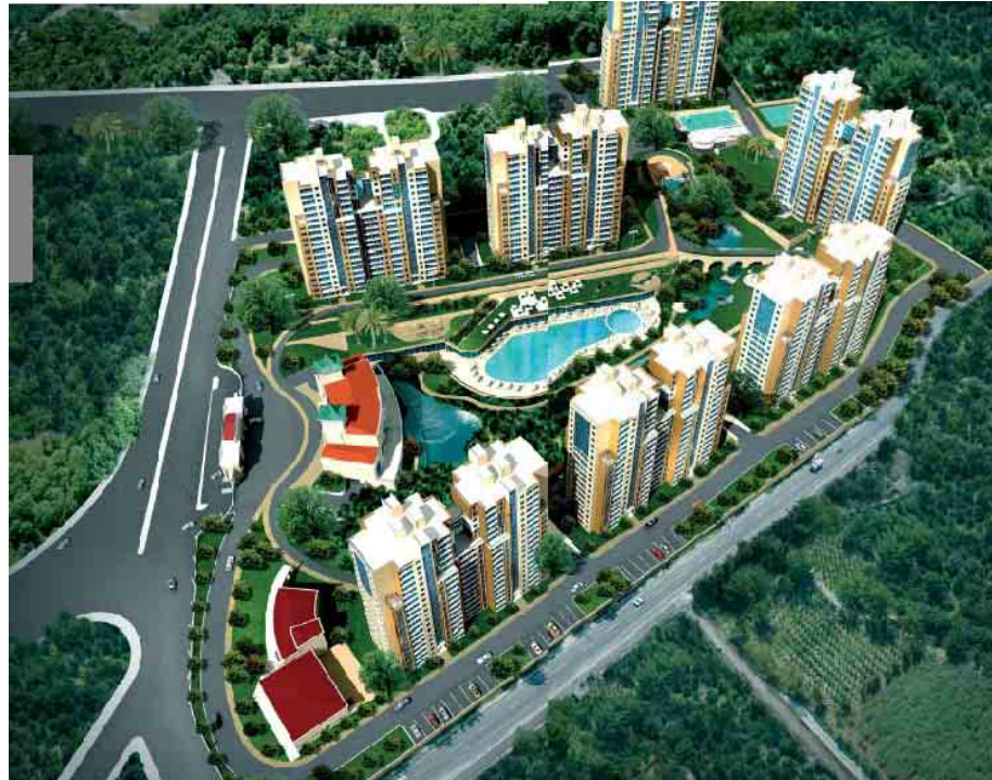
Figure 2. 'Modernist' project in Beylikdüzü, İstanbul (Modernist project catalogue)

The second project is 'Pelican Hill' having a slogan like 'the largest and conceptual mansion project' near ecologically sensitive environment, Lake Büyükçekmece in Hadimköy which covers an area about 20 ha. 713 villas will be built and 161 of them were completed in the first phase and more than half of them were sold now with a great interest (Figure 3). The total