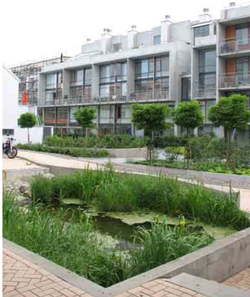
Figure 15. Bo01 ecological-technological housing

paths. Green buses with hybrid engine and car pooling system with battery charged cars are used as sustainable transport. Designed by many urban planners and architects in Housing Expo, Bo01 is a best practice of living city giving ecological courses (Figure 15). All project uses 100% of local and renewable energy (wind, sun, biogas, heat from seawater) (Hancock, 2001), all buildings have 100% of green roofs and as info. technologies, all settlement is a network, online time-reservation operations are held in transportation. All buildings have monitoring screens showing energy consumption, and administrative units serves environmental info. to public from web.