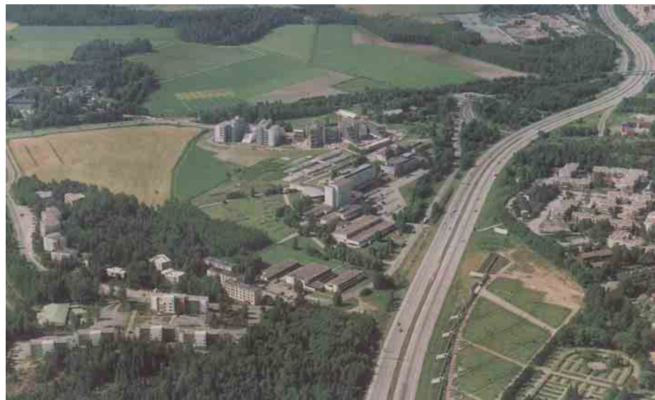
Figure 11. Eco-Viikki, Helsinki (Viikki, 1995)

solutions and new technologies are being applied to attain these goals. The first phase was completed about 2500 residential units and a service centre. The project has its own ecosystem with its own wastewater plant where wastewater is purified, heat recycled and nutrients recovered with new technologies after which it is returned to agricultural land. The rain water is led via open drains to the channel then out into lake. Energy is produced in the local heating plant which uses renewable fuel. Combustible waste is recycled as heat and food waste will become biogas. Also the waste is sucked through pipes into a central room by underground waste collection systems against collection vehicle traffic in the area. Solar cells and panels are used to get electricity and hot water. Public transportation such as ferry and light rail system are also part of reducing car use. Fuel station for cars running on electricity, biogas and ethanol exists in the site. Pre-school and school, retail stores, library, concert hall and cultural workshops and theatre transformed from an old factory are the other social services served for the residents. An environmental info. centre disseminates knowledge in the area (Hammarby Sjöstad Report).