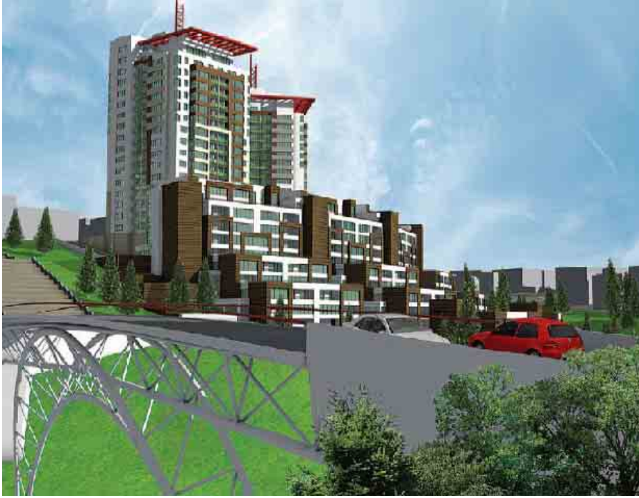
Figure 6. A perspective from ParkVadi project (ParkVadi catalogue)

buildings can be queried according to sun, shade etc. The terrace houses and their roof gardens, the settling according to topography can form the positive sides as urban design. The project aims to attract upper class here with high prices of the residences as gated community.