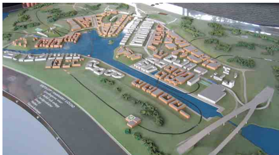
Figure 12. Hammarby Sjöstad model, Stockholm