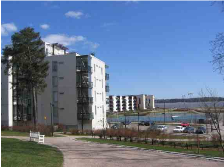
Figure 9. Arabianranta, Helsinki (MIT Center For Real Estate)