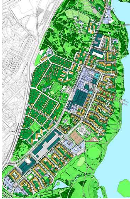
Figure 8. Plan of Arabianranta, Helsinki (City of Helsinki City Planning Dept.)

As being the most developed countries of Europe, Sweden and Finland have great actions and programmes for sustainability. 2 projects from Finnish and 2 projects from Swedish cities are selected for this study. The first project is 'Arabianranta' which is located on the east of Helsinki, is built to eliminate the housing shortage and be an example to new century digital city which covers 85 ha in the bay, 1/3 of the area will be built area (Figure 8). The shoreline will be a park as a part of Helsinki Bay ecosystem and a bird conservation area. In Arabianranta, the central axis passes from ring road through old factory buildings which will be used as cultural center and technology museum (obeying 3 'R's principles- Reduce, Reuse, Recycle) leading via pedestrian gallery to the square. The buildings will rise 3-4 storeys and 5-6 storeys in the other yard, to get as much sun as possible.