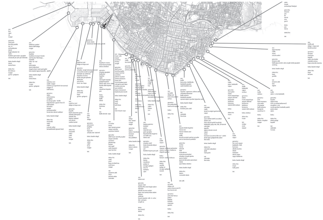
Figure 1. Observation map demonstrates the activities, sounds, smells, colours, wind etc. that are spread along the Karşıyaka Coast. (produced by the project team).

Sense analysis was interpreted in relation to the changing character and experiences from Alaybey to Mavişehir and fourteen sub-character zones were detected with regard to the varying ac-