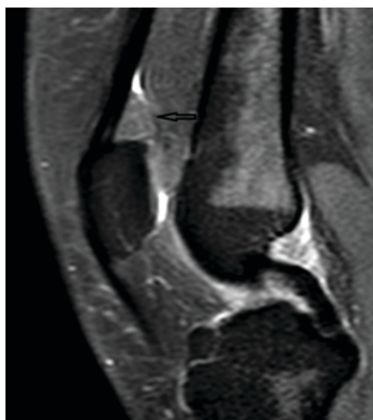
Figure 1: Edema in the suprapatellar fat pad on fat-suppressed T2-weighted images.

Signal changes in the suprapatellar fat pad compatible with edema were found in 56 patients (45.2%). In 68 (54.8%) cases, the suprapatellar fat pad signal was normal. In 77 (62.1%) patients, a mass effect was observed on the adjacent joint space due to convexity in the suprapatellar fat pad posterior contour. Although the mass effect was found in 63.6% (49) of the patients with edema in the suprapatellar fat pad, it was missing in 85.1% (40) of the patients without edema in the suprapatellar fat pad ( P < 0.001 ) (Table 2). No statistically significant difference was found in Insall-Salvati ratio and subcutaneous adipose tissue thickness with the presence of edema in the suprapatellar fat pad ( P = 0.874 and 0.448 , respectively). Similarly, when the age,