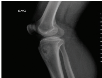
FIGURE 1: Preoperative lateral x-ray of the knee of the patient.

Osteoid osteoma is usually seen in the second or third decades of life, and approximately twice as many men as women are affected (4-6). The most common complaint of osteoid osteoma is pain, often described as being more severe at night. The pain is relieved after taking aspirin (4). The pain relief can be used for diagnosis. In the present case, an interesting osteoid osteoma was observed that showed double nidus on computerized tomography views. Careful and enough curettage should be done for the successful treatment of this disease.