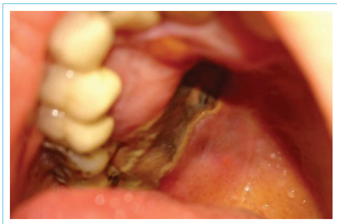
Figure 1. Physical examination revealed an ulcer of approximately 2.5 cm diameter on the right side of the palate, near the second upper molar tooth.

On the first day of hospitalization, her speech became dysarthric; she revealed right-sided hemifacioedema, and double vision due to inward gaze of the right eye because of paralysis of the VI cranial nerve. Furthermore, she had impaired vertical eye movements and outward gaze of the left eye. Neurological examination was also performed and the muscle strengths of left upper and lower extremities