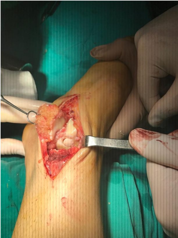
Fig. 3. Medial Malleolar Osteotomy and Mosaicplasty of the Talus

preoperative period was 13 (range, 6-30) months (Table 1).