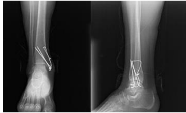
Fig. 4. Postoperative 12th month ankle anterior-posterior and lateral radiography

In patients with chronic osteochondral lesions of the talus, surgical treatment is indicated if the complaints cannot be treated by conservative methods (11). However, there are various contradictions regarding surgical indications and methods (12). Moreover, the choice of surgical technique depends largely on the experience of the surgeon as well as patient-related factors and the availability of surgical services (13-14). Surgical techniques such as arthroscopic debridement and microfracture lead to mechanical insufficiency of the fibrocartilaginous structure by exposing the bone