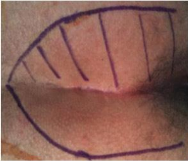
Fig. 1. The mapping of the buttock outer line of contact