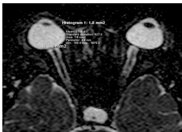
Fig. 1. 48-year-old female MS patient, The optic nerve head ADC measurement from the area including optic nerve 3 mm behind the globe

head/intraorbital segment in MS patients (with or without a history of optic neuritis) in comparison with healthy controls.