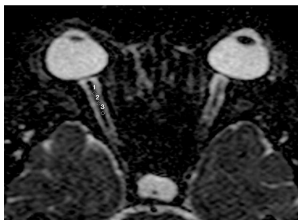
Fig. 2. Three consecutive ADC measurements in the intraorbital segment of the optic nerve

Patients with systemic disease affecting the eye such as diabetes mellitus, Behçet's disease, systemic hypertension, and other neurodegenerative diseases were excluded from the study in both MS patients and control group. Patients with a history of ophthalmic surgical intervention, accompanying glaucoma, or