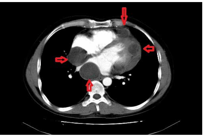
Figure 3. A contrast-enhanced computed tomography showed two cysts in the left - right atrium and small cysts