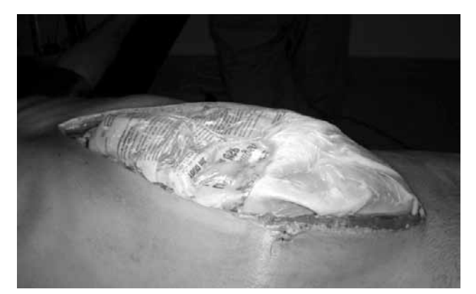
Fig 3. Temporary closure of the abdomen using saline IV bags sandwiched between two layers of Steri-Drape with the adhesive surface adherent to the IV bags. The Drape was spread under the abdominal sheath on both sides and then covered with abdominal towels.