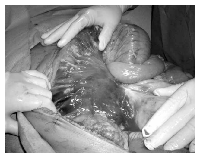
Fig 2. Huge central retroperitoneal hematoma without intraperitoneal bleeding.