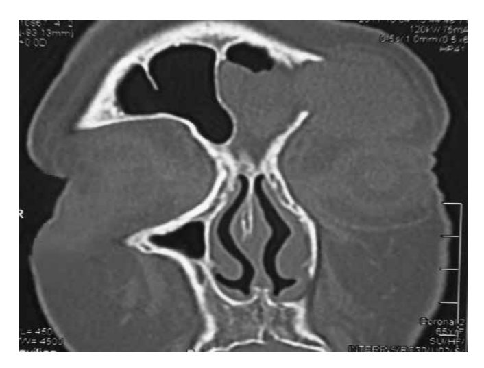
Figure 3. Images on paranasal sinus CT demonstrating the bony dehiscence.