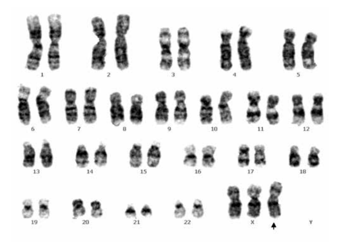
Figure 3 . Chromosome analysis by G-banding technique revealed 47,XXX karyotype.

became negative upon follow-up laboratory assessment. Activity of factor VIII and antithrombin III, and protein C and protein S antigen levels and homocysteine level, were within the reference ranges. Protein factor VIII antibody was not detected.