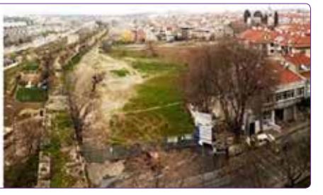
Figure 7. Yedikule Urban Gardens from the same point of view (Left) Yedikule Urban Gardens in 1909 [URL-7] (Middle) Yedikule Urban Gardens in 1900ies [URL-8] (Right) Yedikule Urban Gardens in 2014 [URL-8].