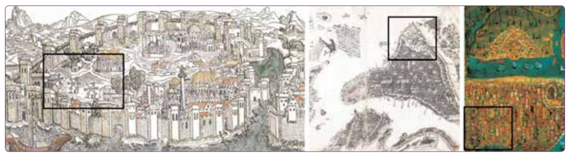
Figure 2. (Left) Ancient view of Istanbul drawn by Hartman Schedel, 1493 (Kayra, 1990: 65) (Middle) Map of Istanbul drawn by Lokman Çelebi, 1584 (Kayra, 1990: 74) (Right) Gravure of Istanbul drawn by of Matrakci Nasuh, 1534 [URL-4].