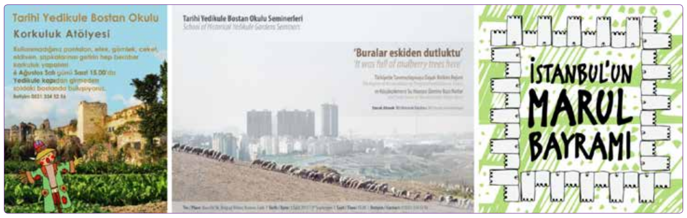
Figure 12. Selected voluntary works and public activities realized in Yedikule Urban Gardens to increase awareness of the society, encourage people and vitalize the site [URL-15].