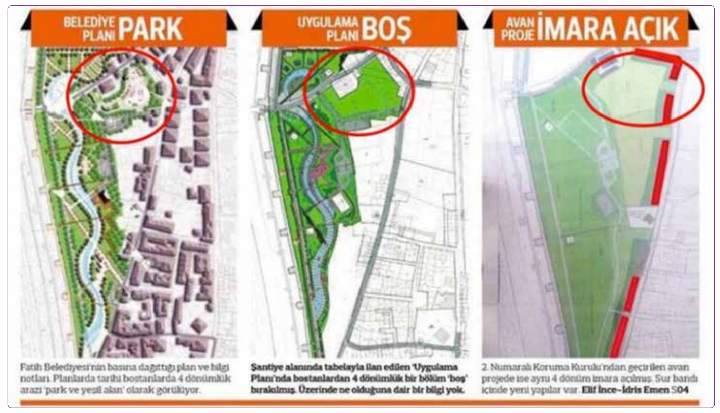
Figure 9. Municipality Plan as a park, Implementation Plan as an empty space and the First Draft as a plan open to development of "Recreation" Implementation Project for Yedikule" [URL-10].

the park project is further spoiled the long-lasting environmental, historical, documentary, aesthetic and artistic, social and cultural, technologic, functional and economic values of Yedikule Urban Gardens. The traces of a unique ecosystem of houses, barns, gardens and resources of Ottoman agricultural technology have been erased day by day.