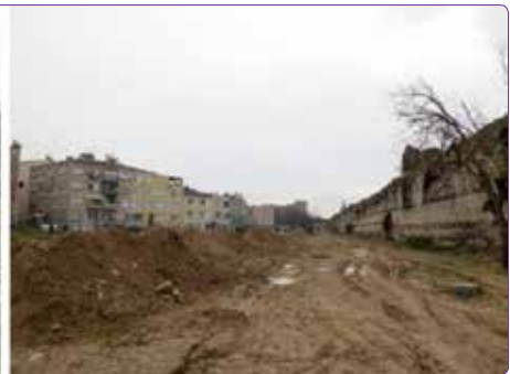
Figure 6. Destruction of Yedikule Urban Gardens.