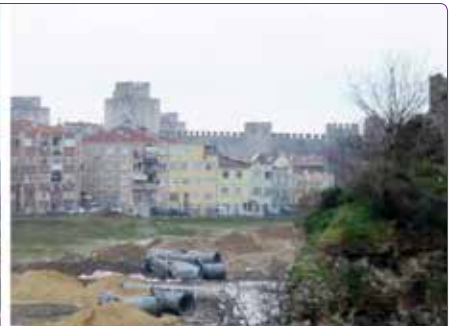
Figure 8. Yedikule Urban Gardens from the same point of view (Left) Yedikule Urban Gardens in 180ies [URL-9] (Middle) Yedikule Urban Gardens in 2013 (Personal Archive of E. Durusoy) (Right) Yedikule Urban Gardens in 2015 (Personal Archive of E. Durusoy).

contradictory with the 1/1000 scale Conservation Implementary Development Plan. Following the adoption of decision of "renewal", bulldozers of Fatih Municipality came to the site and demolished two urban gardens, which were the building blocks numbered 1166 of lot 35 and numbered 1265 of lot 8. They also damaged Theodosius Walls by removing nearly one meter of soil off their basements. However, it is known that the illegal construction activities within the same area started before that decision with Yedikule Villas-four story luxury residences.