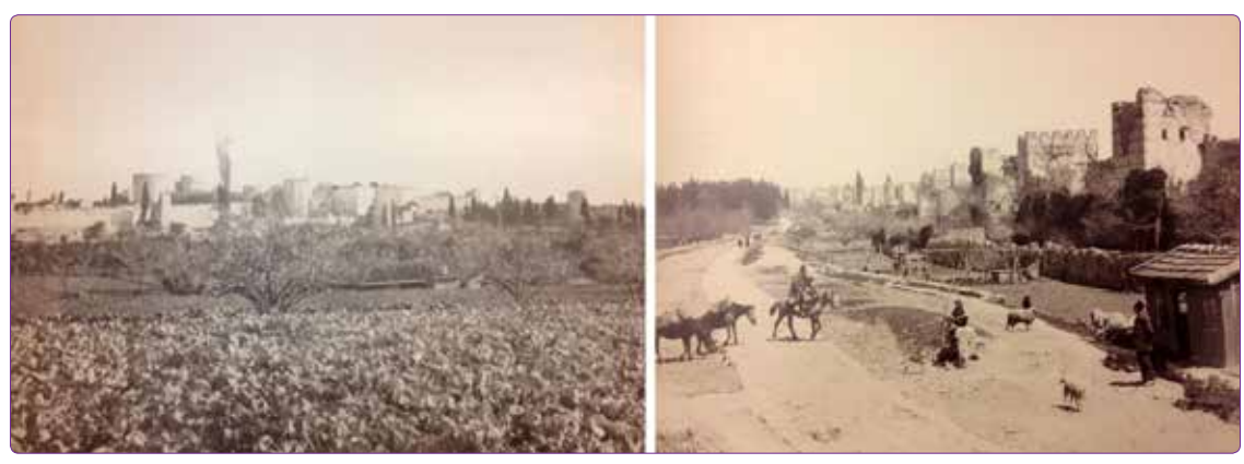
Figure 3. Old pictures showing Yedikule Urban Gardens [URL-5].

their more than 1500 years of history [URL-1]. 19,20 Historical maps, drawings, gravures and old photographs shows that these gardens constituted an integral part of the historic built pattern as urban agricultural landscapes and formed with the boundaries of the historic city along with the Land Walls system (Figure 2 and Figure 3). In other words, it can easily be concluded that Yedikule Urban Gardens have supplied Istanbul since Byzantine times as a direct link to the past besides their importance as a component of the UNESCO heritage site today. Therefore, the use of the urban gardens along the Theodosius fortifications for market gardening of vegetables can be introduced as a continuous tradition that has roots going back to hundreds of years.