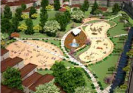
Figure 10. Visuals and details of "Recreation Implementation Project for Yedikule" [URL-11].

ologlar Dernegi Istanbul Subesi) as one of the main bodies composed of a number of Turkish archaeologists who all dispute the destruction of Yedikule Urban Gardens for developing a new community proposed a number of refusal reports by underlining the improper method of excavations taken place in the area and realized several actions focused on local communities to raise public awareness [URL-14]. "Yedikule Gardens Protection Initiative" (Yedikule Bostanlari Girisimi), another active group, has also worked on different projects for people to come and learn the living traditions and urban agriculture with the help of forums, exhibitions, courses and other activities with the help of experts and institutions from different disciplines [URL-15]. In addition to these working bodies, the contradictory process of Yedikule Urban Gardens have interested and attracted researchers from abroad such that several workshops were carried by Harvard University and RWTH Aachen University with supports of Kadir Has University, Okan University, Istanbul Technical University and Bilkent University [URL-6, URL- 16 and URL-17]. A signature campaign was also initiated under the theme: "Historic mission and traditional function of Yedikule Urban Gardens should be conserved; Yedikule Urban Gardens should remain for urban agriculture." to advocate for UNESCO regarding the protection of the Theodosian Walls and gardens associated [URL-18].