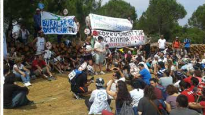
Figure 11. Protests for conserving Yedikule Urban Gardens [URL-19].