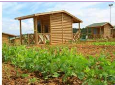
Figure 13. Hobby gardens of Arnavutkoy, Beykoz and Sultangazi; respectively [URL-21].

These urban areas are defined as a significant part of public realm in cities. They have the potential foster ecological, societal and psychological well-begins of both cities and societies through civic participation and collective production in open, green, productive and common spaces. The main proposals for the policy makers and urban planners claim that they should address the significance of these gardens for their ability to create a new understanding of ownership and use rights in cities, their ability to bring people together in a highly culturally diversified world. 60 Moreover, these places as urban and community gardens support the local economies in terms of agricultural production. Besides this being a trendy issue in developed countries, it cannot be overlooked that they rebound people and provide them alternative financial instruments worldwide [URL-22].