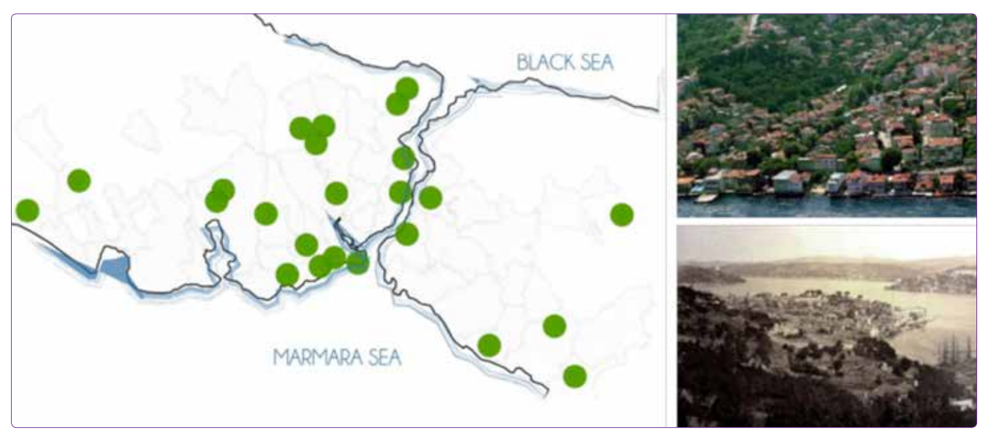
Figure 1. (Left) Distribution of urban gardens through Istanbul, prepared with the help of information coming from the records of Kaldjian and Google Earth (Prepared by Authors) (Right-Top) Kuzguncuk Urban Gardens, 2010 [URL-2] (Right-Bottom) Arnavutköy Urban Gardens, Date Unknown [URL-3].

firstly mentioned in old Byzantine recordings during 5<sup>th</sup> century AD.<sup>10</sup> Following this, they were underlined in the early farming, food production and consumption recordings of ancient Byzantium - Geoponica that is considered to be written and compiled in between 944-59 AD, over a thousand years ago.<sup>11–13</sup> Then, Evliya Celebi, the 17<sup>th</sup> century Ottoman traveler, recorded 4395 gardens that approximately equal to 16,500 square meter fertile green lands within the city.<sup>14</sup> Eremya Celebi Komurcuyan, an Ottoman poet, traveler and historian, also noted the same garden crops that vegetable production was widespread throughout the city and a part of the daily life of several neighborhoods.<sup>15,16</sup> At the end of the 19<sup>th</sup> century, more than a hundred of clusters of urban gardens were recorded within Istanbul.<sup>17</sup>