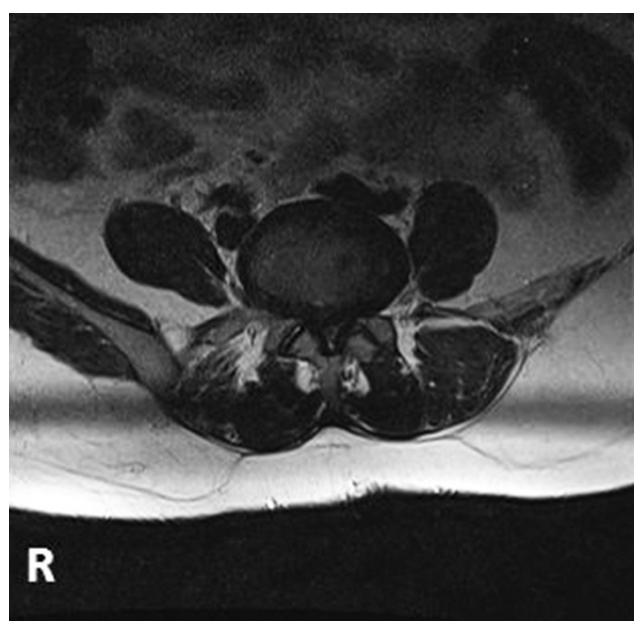
Figure 2. Computerized tomography image showing the lumbar pathology.

examined through Mann Whitney U test. Pearson's chi-square test was used in order to show that the distribution of the gender groups was similar. Friedman test was used in order to examine as to whether there was a statistically significant difference in terms of VAS levels between monitoring times among the groups. When Friedman test statistical results were found significant, Wilcoxon Sign test was used to detect the monitoring time(s) that caused the difference. Unless otherwise indicated, p<0.05 results were considered statistically significant. However, in all probable multiple comparisons, Bonferroni Correction was made in order to control Type I error.