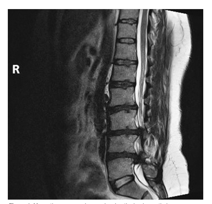
Figure 1. Magnetic resonance image showing the lumbar pathology.