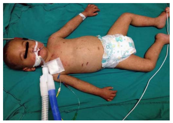
Photo 1. In the body, petechiae, rash lesions and mechanical ventilatory support was provided due to respiratory failure.

(27.100/mL) and thrombocytosis (544000/mm<sup>3</sup>); peripheral blood smear analysis and bone marrow revealed no atypical cells. Among coagulation tests, PT and aPTT values were normal. Lactate concentration of the patient was high as 3.6 mmol/L. Differential diagnosis from respiratory system infections and other exanthematous infectious diseases that present with rashes was performed both clinically and by laboratory analyses. Pathological signals were observed in the bilateral basal ganglia, lentiform and caudate nuclei on cranial CT and MRI examination; hypodense nodular areas were observed on multifocal CT (Figure and hypointense 1); pathological signals on T1-weighted sequences and hyperintense pathological signals on T2weighted sequences were observed on MRI (Figure 2,3). Contrast-enhanced examination demonstrated contrast agent uptake in the defined areas, and contrasting in gyral pattern attracted attention in both frontal regions.