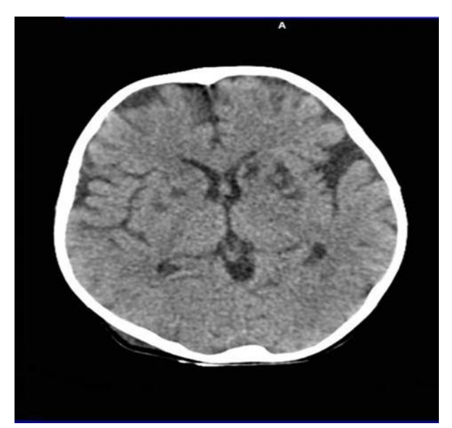
Fig. 1. In CT; hypodense nodular areas were observed on multi-focal.

Underlying metabolic defect is not known definitely. Whether it is associated with the metabolisms of isoleucine, methionine or other amino acids is not clear (7,8). EE has been