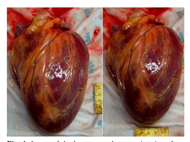
Fig. 1. Image of the heart: note the excessive size of diameters.

The heart was significantly increased in shape and volume, with a weight of 1050 g and longitudinal diameter (LD) of 16.5 cm, transverse diameter (TD) of 16 cm and antero-posterior diameter (APD) of 9 cm (Figure 1), and on palpation the consistency was significantly increased.