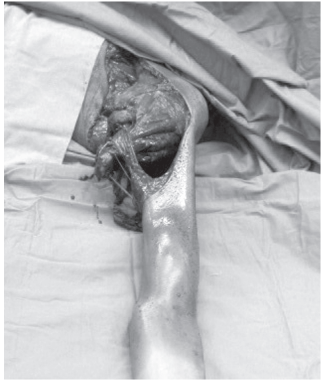
Figure 2. Intraoperative image of avulsion type brachial plexus injury.

treated with an end-to-end anastomosis, and the patient received neurotization of n. medianus and n. ulnaris, from the proximal aspect of n.axillaris, n. radialis. Avulsion type BP damage indicates that the injury was caused by a propeller, but not being able shred the patient's clothes wholly, the propeller movement resulted in traction of plexus.