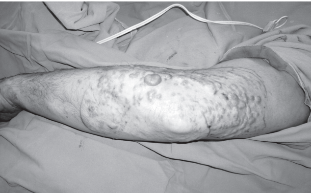
Figure 1. Multiple cutaneous leiomyomas on the left arm.

After standard monitoring was applied (electrocardiogram, pulse oximetry, and noninvasive blood pressure) the patient was sedated with iv midazolam 2 mg and fentanyl 100 mcg.