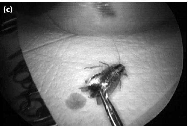
Figure 1. (a) A live insect in the EAC. (b) An insect was removed with forceps after EMLA cream application. (c) An inactivate insect after removal.

mors, frostbite, burns, trauma and rarely foreign bodies are other causes of primary otalgia. Secondary otalgia is caused by diseases in the paranasal sinuses, nose, and pharynx or, frequently, from temporomandibular and cervical spine disorders. The cause of secondary otalgia can also be referred pain from the mouth, teeth, larynx, or thyroid gland; neural, vascular, or lymphatic structures of the neck; or the esophagus, heart, or lungs. [1-3]