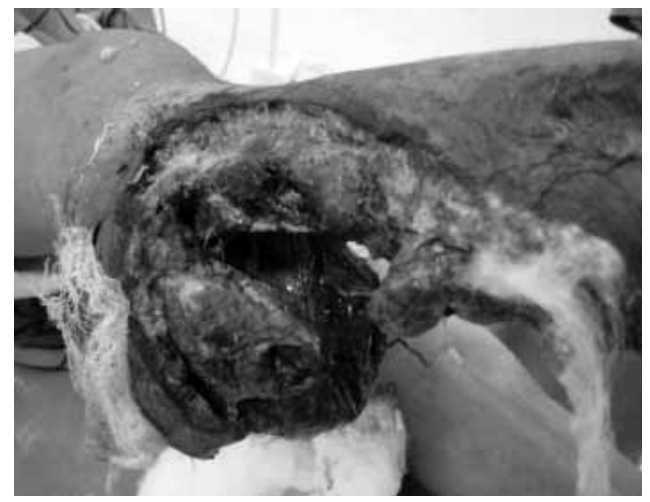
Fig. 2. Traumatic amputation with grossly contaminated wound.

The earthquake that hit Northern Pakistan was one of the worst in human history. No individual or government is prepared for this kind of catastrophe