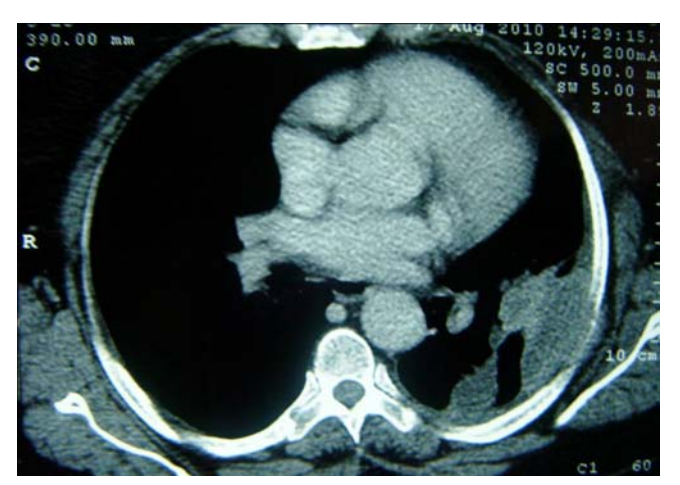
Figure 2: Pleural-based mass on the chest tomography.

hemoptysis, or sputum in the patient's history. Her physical examination revealed dullness and pain on her left hemithorax. The chest x-ray was performed and showed a pleural-based mass at the left hemithorax. The computed tomography (CT) of the chest revealed a pleural-based heterogeneous mass of 5x9x10 cm with rib destruction leading the rib destruction at the lower lobe laterobasal segment of the left hemithorax (Figure 2).