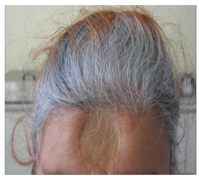
Figure 1: The localization of primary tumor.

A 57-year-old woman presented with a nodular lesion on the left frontal region at her scalp in September 2007. The lesion was excised together with a piece of the frontal bone (Figure 1). Immunohistochemical examination of the pathological specimen confirmed the diagnosis of a malignant trichilemmal tumor. The margin was negative for tumor cells. The patient was followed-up without adjuvant therapy including chemotherapy and radiotherapy.