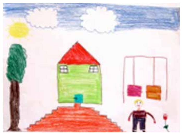
Figure 3. The schematic phase (ages 7-9).