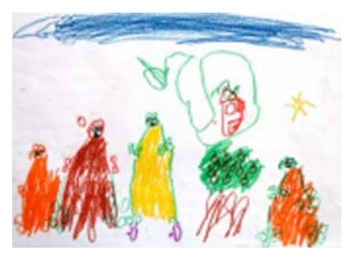
Figure 2. The pre schematic phase (ages 4-7).