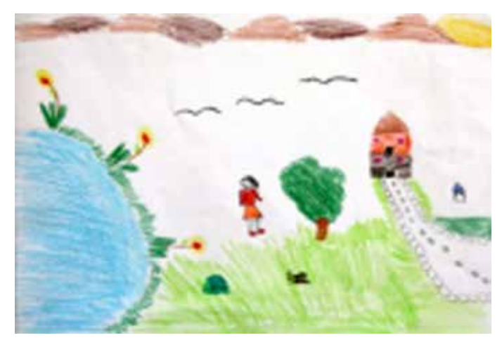
Figure 4. The realism (grouping) phase (ages 9-12).