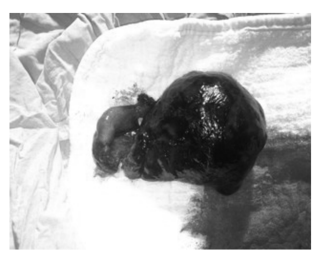
Figure 2. Macroscopic view, gangrenous enlarged ovary and fallopian tube.

ic cyst with regular wall and surrounded by a scant amount of ovarian tissue was discovered in the pouch of Douglas and left adnexia was normal with no cystic-solid formation (Figure 1).